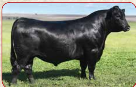
Ridl Roosevelt 820