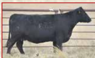
CN Blackbird Susan 553, Dam

REG#19847737 BD: 3-1-20 Tattoo: 840 Bull BW: 89 Adj. WW: 695