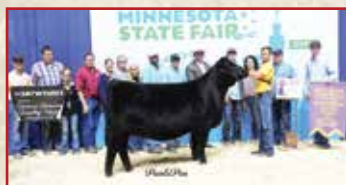
Chestnut Queedy WJ 829, Dam • 2019 Reserve Champion Female MN State Fair

Directly out of the Reserve Champion Female at the 2019 Minnesota State Fair. He lands in the top 10% of the breed for WW and YW as well as $W. He ratioed 104 at a year and is as good looking and impressive as his mom! His mom has seen the purple, this guy will put you in the purple premium category when it comes time to cash in his progeny!