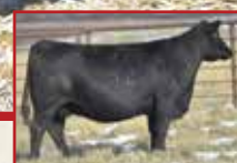
Chestnut Queen of Wetonka 56, Grandam