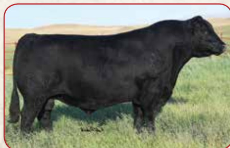
EXAR Monumental 6056B