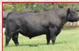
Chestnut Redemption 38, Maternal Brother

CFCC Black Jack 001 KR Cadillac Jack WK Blackbird 5066 KR Synergy Summitcrest Focus 2U66 Dickaus 2U66 FW 416 Dickaus FW Cash 239 K C F Bennett Absolute HAYNES Outright 452 HAYNES ND 454 Miss 179 Chestnut Wetonka WJ 63 Chestnut Power One 19 Chestnut Wetonka A S 461 Chestnut Wetonka WJ PF 242