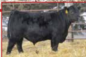
Chestnut Stunner 179, Maternal Brother