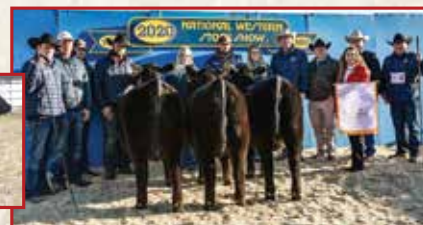
645 Sister Member of the Champion Pen Heifers