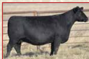
Chestnut Ruby WJ 530, Dam

REG#19847734 BD: 2-26-20 Tattoo: 780 Bull BW: 88 Adj. WW: 646 Top 10% RADG, 15% YW and $F, 25% $B and WW. Top 20% Docility and out of one of the top selling 5 year old cows on our 2020 Fall Female Sale. Chestnut bred on both sides of this ones pedigree, he's super complete and will certainly generate pounds to your calf crop. BW: +2.0 WW: +66 YW: +126 Milk: +13 $W: +47 $F: +101 $B: +149 $C: +235