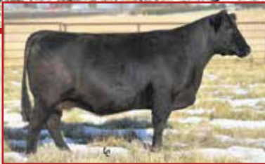
Chestnut Beauty 570, Dam