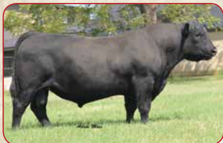
CN Redemption 38