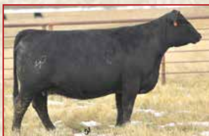
Chestnut Freedom Lady 546, Dam