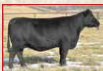
Chestnut Beauty 568, Dam

SydGen Exceed 3223 SydGen Enhance SydGen Rita 2618 2XL Evolution 7033 Baldridge Waylon W34 2XL Opal 5933 EC Objective N2189 Lemar Dakota Gold 18T WCF Gold 377 Willow Creek 5101 899 5158 Chesnut Beauty 568 Mogck Bullseye CHestnut Beauty 326 CN Beauty Dateline 7407