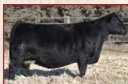
Chestnut Wetonka WJ 63, Dam

Here is a maternal brother to Chestnut Redemption 38! He lands in the top 10% of the breed for CED, BW and $M. Top 15% $W, Top 25% WW and $F. Visually, he's an absolute beast and also ratioed 111 at weaning time! We could write stories and scenarios as to different matings this guy's mom could go based on her track record, but the truth of the matter is, she will be a featured 5 year old on our 2021 Fall Female Sale! This guy is an absolute stud and one you're not gonna want to miss come sale day!