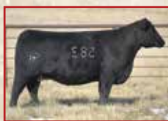
Chestnut Primrose 583, Dam

REG#19847729 BD: 2-15-20 Tattoo: 690 Bull BW: 94 Adj. WW: 726