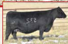
Chestnut Queen Eva 532, Grandam

Top 1% of the breed for WW and YW, 2% $W. Top 5% $M, Top 10% $F, $C, RADG and CW. He ratios 118 at weaning time and all this is off of a first calf heifer. He was also a member of the 2021 Grand Champion Pen of 3 Bulls at the Inaugural Cattlemen's Congress in Oklahoma! Descending from Pathfinders on BOTH sides of his pedigree, simply put this is one awesome complete Angus bull, the kind that we strive to produce each and every day! Cattle like this are why we do what we do! They are the right kind for the industry!