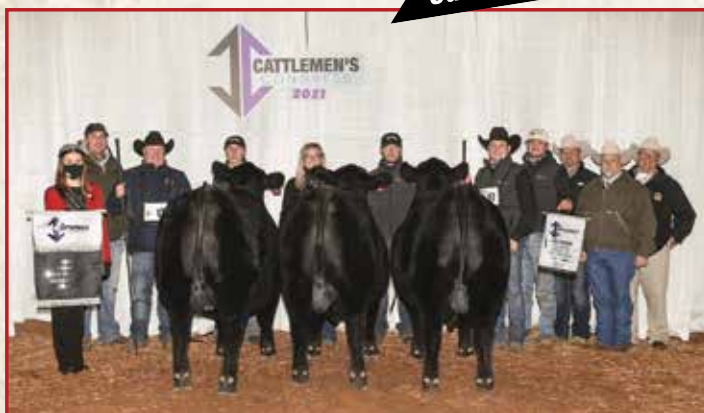
Champion Pen of 3 Cattlemen's Congress featuring Lot 2 & 3

REG#19847817 BD: 1-15-20 Tattoo: 80 Bull BW: 75 Adj. WW: 885 Varilek Product 2010 04 3F Epic 4631 Zebo Queen 1072 Chestnut Redemption 38 HAYNES Outright 452 Chestnut Wetonka WJ 63 Chestnut Wetonka A S 461 A A R Leupold 0578 GDAR Leupold 298 GDAR Miss Blackcap 9232 NSF Scotch Lady E34 S A V Brilliance 8077 NSF Scotch Lady Z12 RR Scotch Lady 4323 BW: +0 WW: +80 YW: +140 Milk: +22 $W: +82 $F: +104 $B: +145 $C: +260