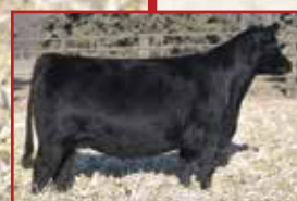
CN PF Beauty 750, Dam