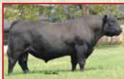
Chestnut Redemption 38, Sire