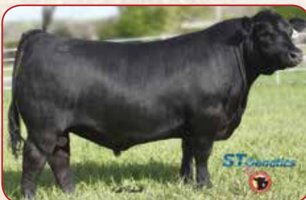
HF Long Shot 71D