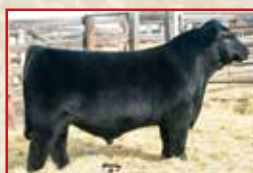
Chestnut Knock Out, Sire

The ONLY Knock Out of the entire sale. Its no secret what Knock Out has done for not only our program, but others across the country. The cattle flat out perform and possess a little extra look to go along with it. This guy is no exception, buy with confidence!