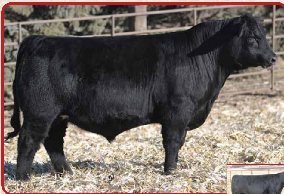
Chestnut Queen 566, Dam