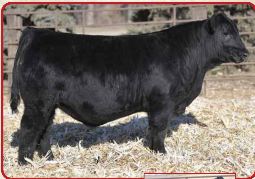
CN DJ Annie Oakley 565, Dam

Top 10% of the breed for WW and YW as well as $F and $B. Top 5% RADG and ratioed 114 at weaning. Directly out of a Pathfinder dam and one that has and will to continue to flat out perform. He's a Beast and we are certain he will add pounds with rapid gain to his progeny.