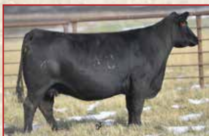
CN Queen Of Wetonka 56, Dam