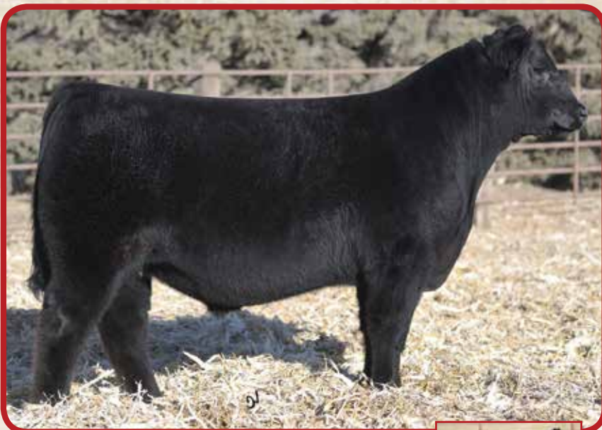
Chestnut Queedy WJ 829, Maternal Sister • 2019 Reserve Supreme Champion Female MN State Fair

A Maternal Brother to the Reserve Supreme Champion Female at the 2019 Minnesota State Fair! He lands in the top 20% $B and YW as well as RADG. Top 5% $F and rationing 109 at weaning! Big legged, big topped and extra good looking, this guy combines performance on foot and paper with that extra striking good look!