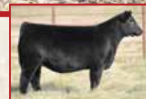
975, $20,000 Maternal Sister