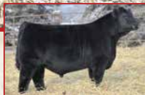
Chestnut Turning Point 29, $40,000 Maternal Brother