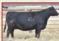
Chestnut PF Beauty 536, Dam

S A V Privilege 3030 Vermilion Roughrider Vermilion Blackette 3139 Ridl Roosevelt 820 Apex Windy 078 Ridl Katrina 326 RF Katrina 025 MCC Daybreak Woodhill Daybreak U280-X20 Woodhill Evergreen 285M-U280 Chestnut PF Beauty 536 Fruhling Shadow Chestnut PF Beauty 333 Chestnut PF beauty 088